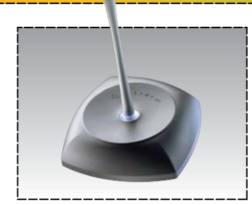
Orderman Base Station.