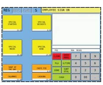
SPS-2000 Screen Showing Real Time Current Stock on Buttons.