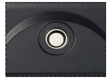
SPS-2000 Magnetic Dallas Clerk Sign-On Feature.

■ Reports can then be viewed directly on the FTP Website using a standard Web Browser or sent to an email address or to a mobile phone as a text message.